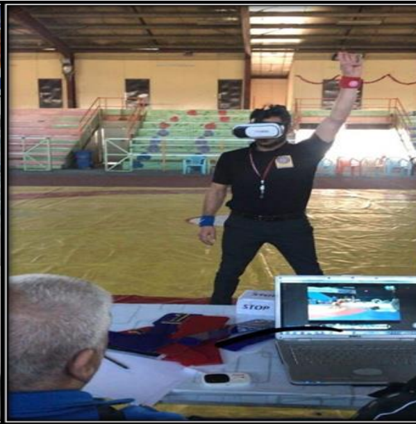
Indicates referee evaluation test.